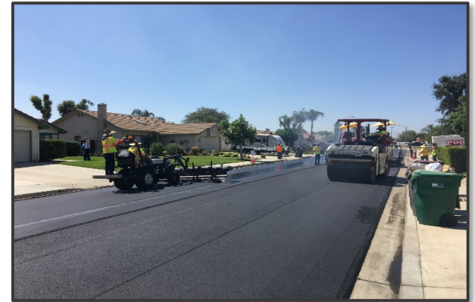
Rustler's Ranch Phase II