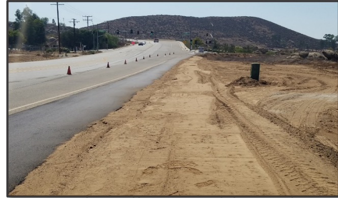
AC Sidewalk to Boulder Ridge Middle School